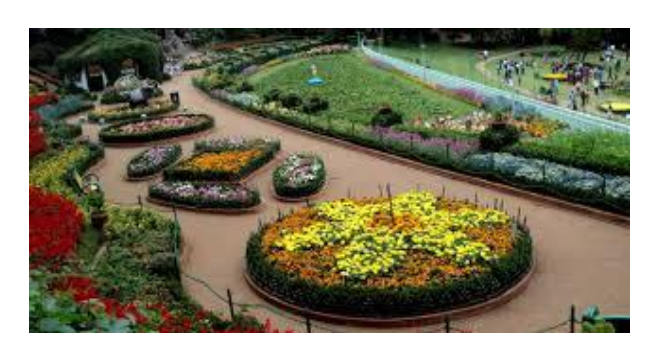
Day 06 Ooty & Coonoor Local Sightseeing

After breakfast Proceed to Coonoor. Coonoor Sight-seeing (Sim's Park, Lam's Rock, Dolphin Nose and Ketti Valley - beautiful scenic views of the valley). Also visit Tea factory, Tea Museum and Doddabetta Peak - highest peak of the Nilgiri mountain range. Overnight stay at Ooty.