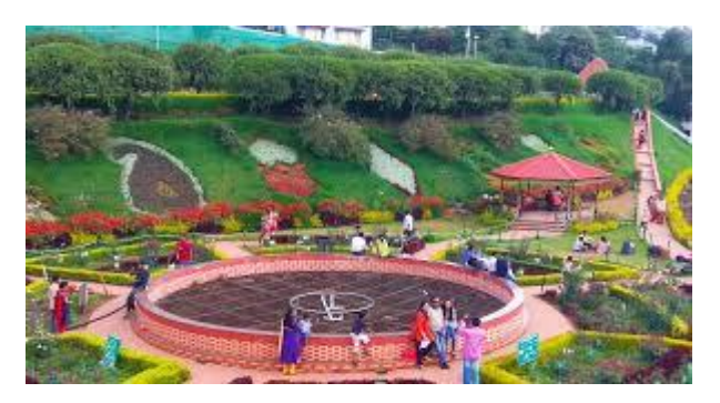
Day 05 Coorg to Ooty Local Sightseeing

After breakfast checkout and proceed to Ooty, on arrival check in to hotel. Visit Rose Garden, Ooty Lake and Botanical Garden. Overnight stay at Ooty.