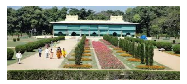
Day -02: Bangalore to Mysore Sightseeing

After breakfast proceed to Mysore. En route visit Srirangapatna(Dariya Daulat Bagh, Gumbaz, Tippu Fort and Sri Ranganathaswamy Temple). On arrival check in to hotel.