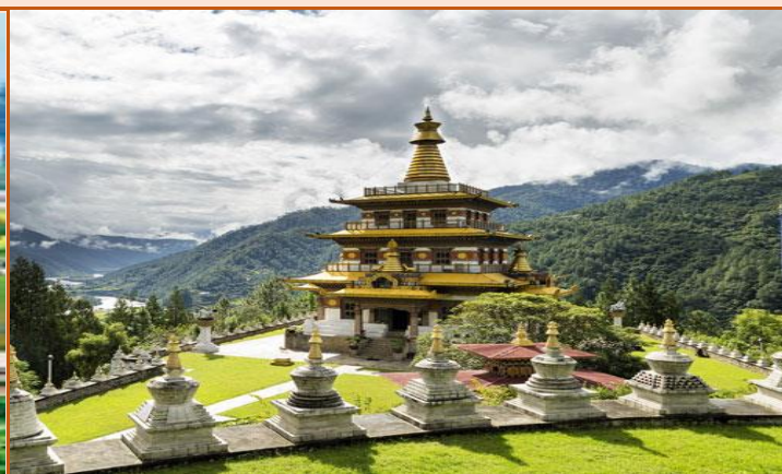
03 NIGHT'S GANGTOK